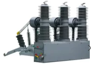
ZW32-35 Outdoor Vacuum Ci Breaker