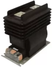
0-10V Current Transformer