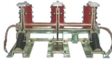
12kV Indoor High Voltage Switchgear Earthing Switch