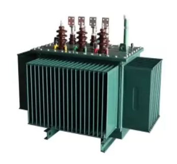
2500 KVA Three Phase Oil Filled Distribution Transformer