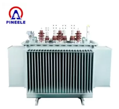
Compact Substation Transformer