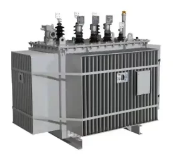
1000KVA 11KV/0.4KV Oil Type Distribution Transformer