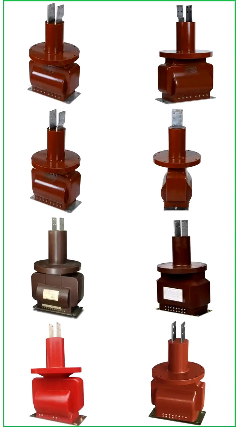
Industry Context and Market Trends

As the global industrial automation and energy efficiency sectors evolve, so does the demand for compact, accurate, and integrable current sensors. According to MarketsandMarkets, the current sensors market is projected to reach over USD 3.3 billion by 2027, driven by increasing investments in industrial monitoring and smart grid systems.